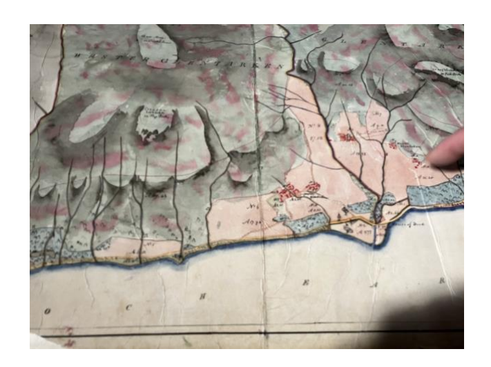
Notes - Knox listed under arable the 'houses Yards and Area.