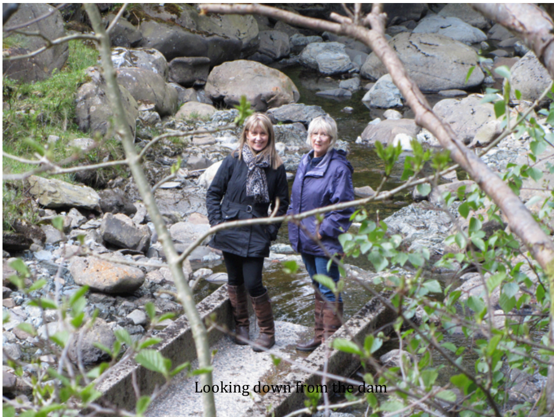
Looking down from the dam

The Allt Ghoinean burn is claimed to be the Gonan or Monan of Sir Walter Scott's poem, 'The Lady of the Lake'. "The stag at eve had drunk his fill, where danced the moon on Monan's rill."