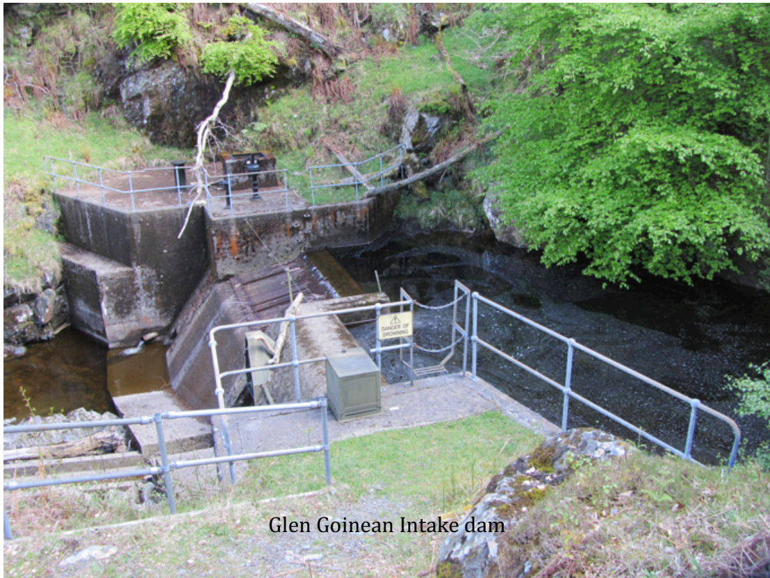
Glen Goinean Intake dam