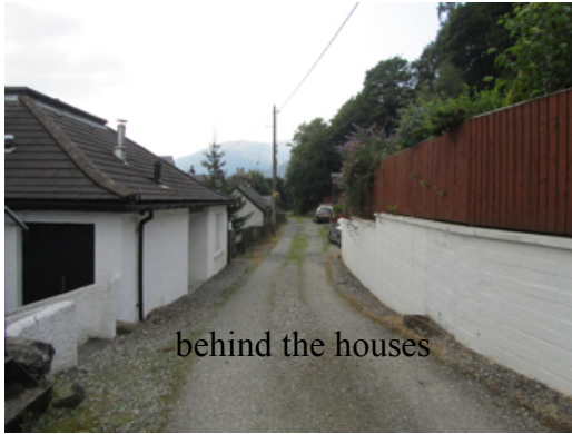
behind the houses

This track emerges on to the main road a little further west, beside the Four Seasons Hotel, with wonderful views looking up the length of Loch Earn. There are often ducks and geese on the foreshore, at this point.