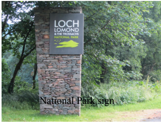
National Park sign

Just beyond the farm, turn right up Station Road, and after about 100 metres keep right towards the Station Caravan Park.