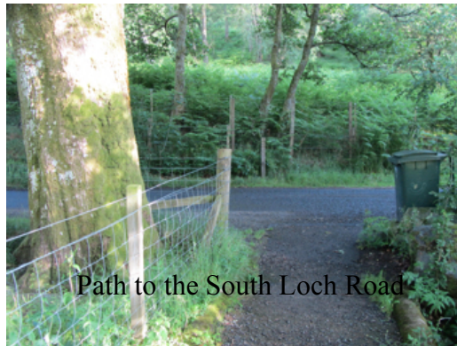
Path to the South Loch Road

Walk along the road for about ½ mile, past the weir on your left and St Fillans Golf Club on your right,