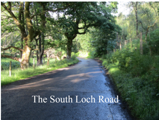
The South Loch Road

eventually bearing left to the main road via the old Dundurn Bridge.