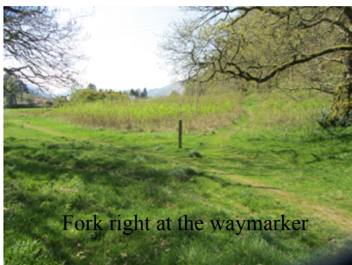
Fork right at the waymarker