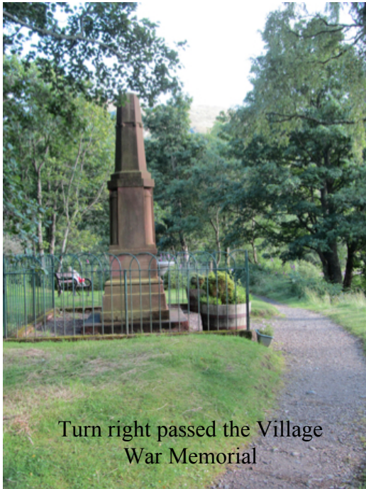
Turn right passed the Village War Memorial

Follow the path a short way around the end of Loch Earn to the South Loch Road and there, turn left.