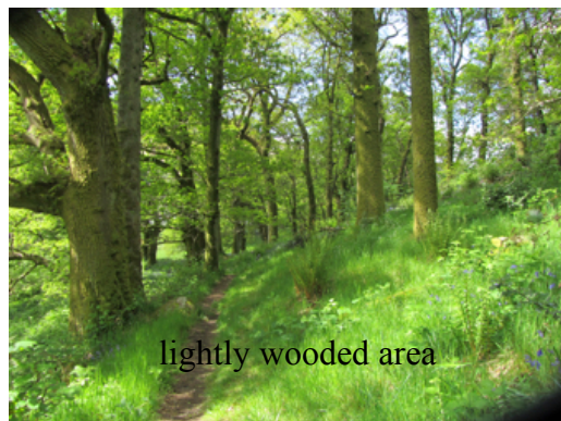
lightly wooded area

Just before reaching the playing field behind the village, fork right (A)